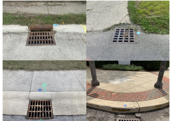
Examples of Drains that are Marked